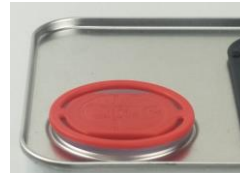
Force the closure snug into the opening