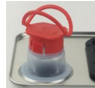
Use the diagram on the closure to open