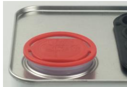
Place closure concentric with opening