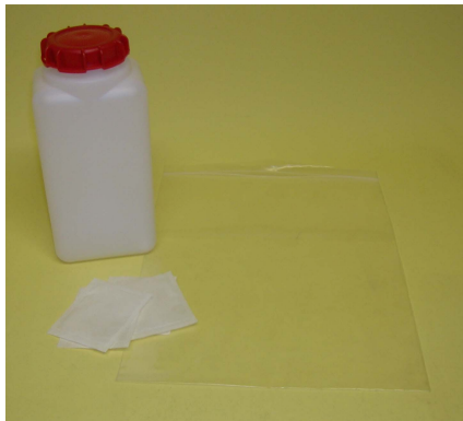
Primary Receptacle and Secondary Package